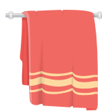
Bath Towels (dark colors)