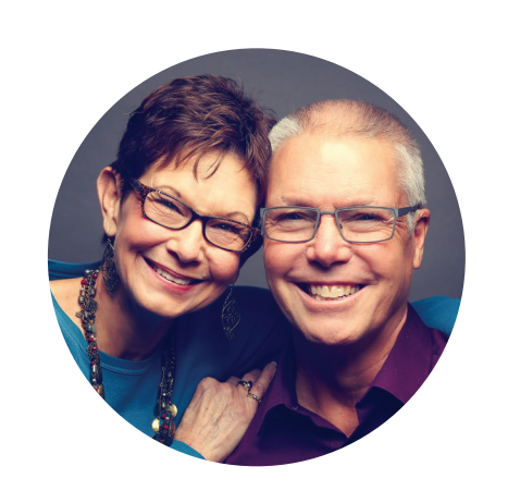
"We decided to express our gratitude by making a financial contribution in our estate plan."