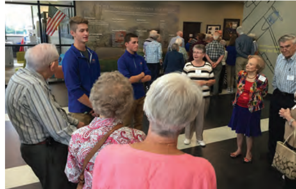
1892 Society members enjoyed lunch and a tour at the West Michigan Aviation Academy.